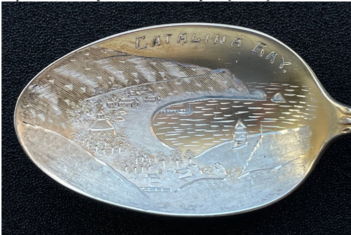
Caption 5, Variety 2 - "Catalina Bay" (C5-V2)

on J. Mayer & Bros. - Catalina themes "Tuna"